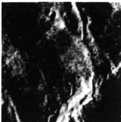
Jet Propulsion Laboratory

Top drummer for the view that the stone face proves that an alien race once flourished on Mars is writer